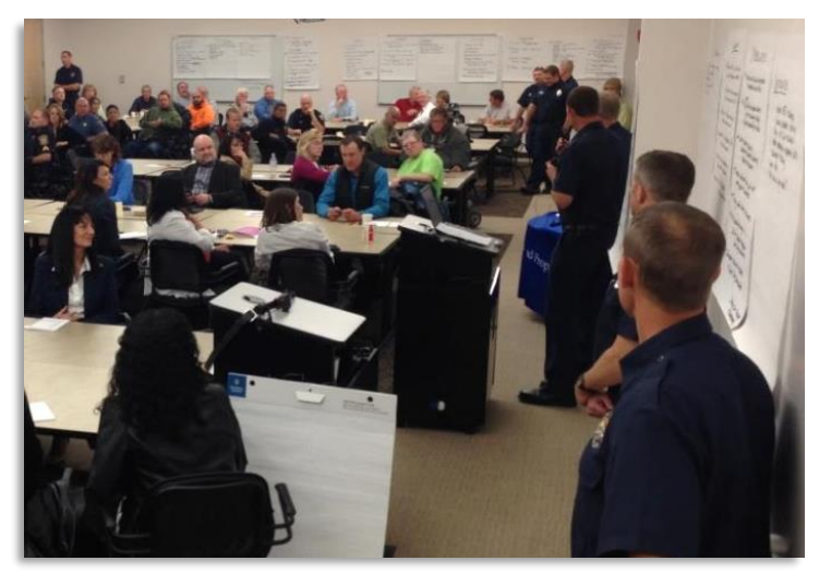
"Whatever It Takes" ... To Serve.

As we serve both our internal and external customers, we assert that our greatest strength and fundamental value lies in the inspiration, dedication, and innovation of every employee of the District. Working towards continuous improvement and excellence, we confidently commit to our community that when the alarm sounds, we will respond quickly, arrive prepared, and be ready to fulfill our motto,