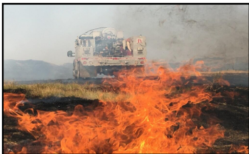
West Metro Fire Rescue is an Equal Opportunity Employer (EOE)